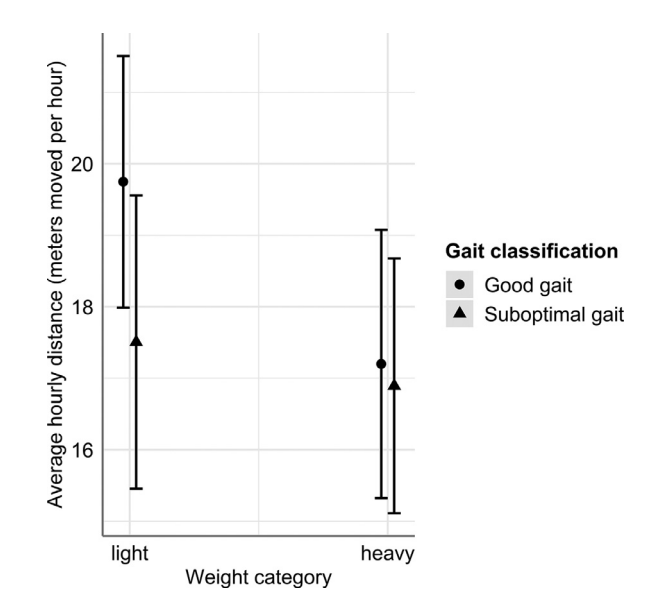
Figure 2. Linear mixed-effects model estimated average hourly distance for good gait and suboptimal gait birds, in interaction with weight category. Bars represent 95% CIs.