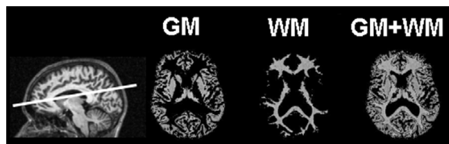
Example of segmented axial MTR map (level indicated at the sagittal image). Visualized are the compartments grey matter (GM), white matter (WM) and grey and white matter (GM + WM). Signal intensities represent MTR values. MTR, magnetization transfer ratio.

explain their neuropsychiatric symptoms. Therefore, in all patients diffuse involvement of the CNS was thought to underlie the neuropsychiatric manifestations. We observed lower values for mean MTR and peak location in grey and white matter in patients positive for aCLs and Lac.