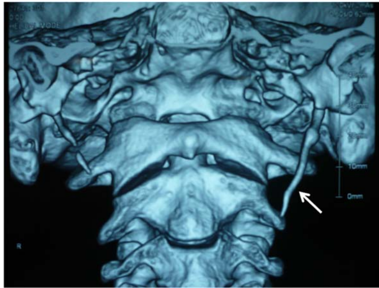
Figure 1 Elongated left styloid process (arrow). The length of left process was 44 mm, while that of the right was 25 mm.

extension. An endoscope was inserted through the mouth, and the magnified surgical field allowed identification of the small vessels and nerves and allowed the surgeon to avoid injuries. Unilateral tonsillectomy was performed first, the tonsillar bed was palpated and the tip of the styloid process was identified. The mucosa was separated longitudinally at the point of palpation of the process in the tonsillar fossa. The tissue of the parapharyngeal space was carefully separated by q-tips to avoid