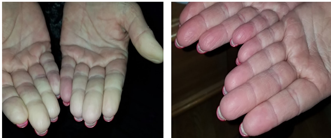
Figure 1. Images of patient's Raynaud's episode during cold and rewarming.

investigation include pre-existing systemic and organ-specific autoantibodies, including antithyroidal antibodies [2], as well as peripheral blood cellular ratios [3].