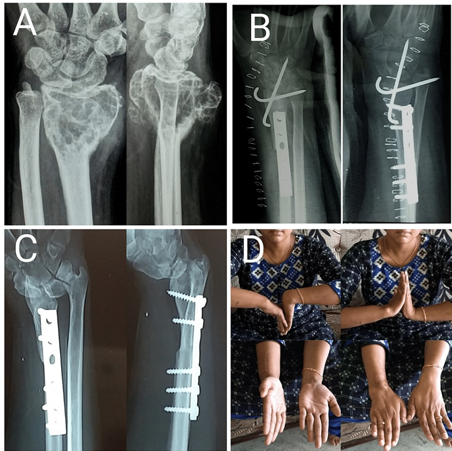
FIGURE 4: Case images of a 23-year-old female patient with Campanacci grade III giant cell tumor of right distal radius

(A) Preoperative radiograph showing giant cell tumor of distal radius; (B) Immediate postoperative radiograph showing wide excision and ipsilateral proximal fibular autograft; (C) One-year post-operative radiograph showing union at fibuloradial junction with subluxation at wrist joint; (D) Reduced forearm rotations but good wrist and hand function after fibular autograft.