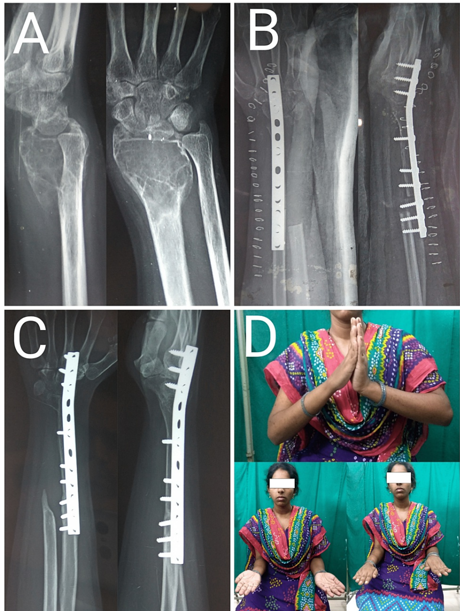
FIGURE 3: Case images of a 20-year-old female patient with Campanacci grade III giant cell tumor of right distal radius

(A) Preoperative radiograph showing giant cell tumor of radius; (B) Immediate postoperative radiograph showing wide excision and ulnar translocation; (C) One-year post-operative radiograph showing union at ulnoradial and ulnocarpal junction; (D) Good forearm rotations and acceptable wrist and hand function