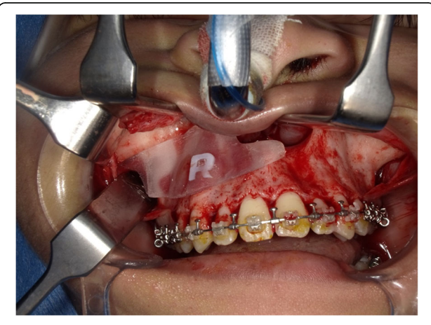
Fig. 3 Intraoperative view of the osteotomy using the three-dimensional device (right side)

We have also created preoperative 3D-printed models of cases for tumors in maxilla and mandible jaw