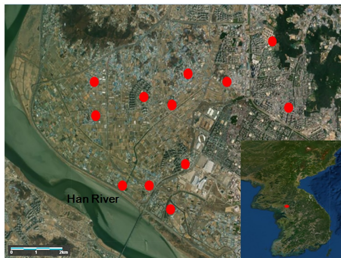
Fig 1. Locations of black light traps at 12 sites in Goyang, Korea, 2008–2012.

Mosquito average abundance and climate data were summarized as the means and standard deviations obtained over 5 years based on 23–43 weeks per year. Time series plots were used to