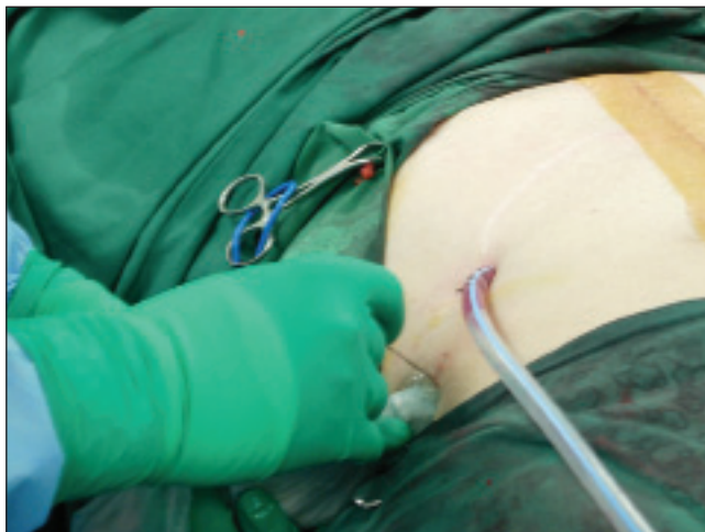
Figure 1: Tuohy needle (18-G) inserted anterior to Ultrasound transducer, which is held transversely in plane to perform the TAP block

The technique used was posterior approach. [5] The investigator was scrubbed and gowned and the ultrasound probe was covered by a sterile plastic cover and placed in the midaxillary line just superior to the iliac crest [Figure 1]. After identifying the abdominal layers, the transversus abdominal plane was reached by using an 18-G Touhy's needle (Portex Epidural Minipack, Smiths Medical Australasia Pty, Brisbane, QLD, Australia). Correct placement of the needle tip was confirmed by injecting 5-10 ml of saline bilaterally. A bolus dose of 15 ml of 0.5% ropivacaine (Naropin, Astra Zeneca, Sydney, NSW, Australia) was administered [Figure 2]. The epidural catheter (Portex Epidural Minipack, Smiths Medical Australasia Pty, Brisbane, QLD, Australia) was then advanced cephalad up to the 10-15 cm skin mark. The needle was removed and catheter connected to a bacterial filter. A 0.2% ropivacaine infusion at 8-10 ml/hr was continued for 72 hours on each side. Our technique involved placement of the bevel of the needle superiorly, and then inserting the catheter and to advance it as superiorly as possible. The catheter needs to be advanced normally up to the 10 cm mark but may require to be advanced up to 15 cm mark in obese patients.