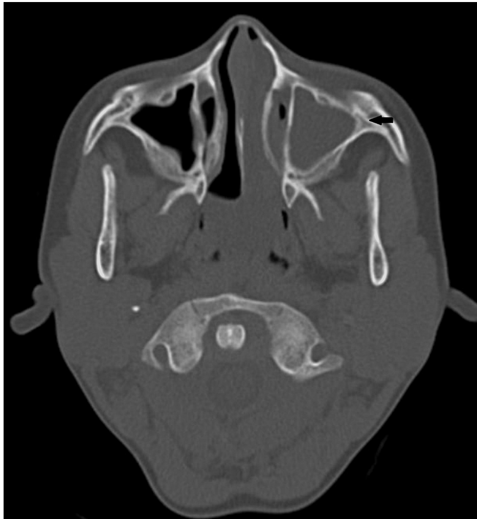
FIGURE 3: Axial CT scan showing complete haziness of the left maxillary sinus and nostril with thinning of the nasal septum

mucosal thickening with ethmoid and sphenoid sinuses (Figure 4). Considering the clinical course of the disease, clinical presentation, CT scan evaluation, and demographic details of the patient favor clinical and imaging diagnosis of tegumentary mucosal leishmaniasis involving the left nostril and maxillary sinus. A cytological smear taken from the nasal mucosa showed plenty of chronic inflammatory cells.