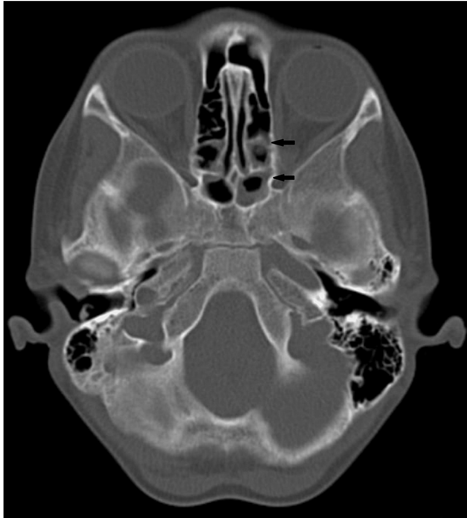
FIGURE 4: Axial CT scan showing partial mucosal thickening of ethmoid and sphenoid sinuses (black arrow)