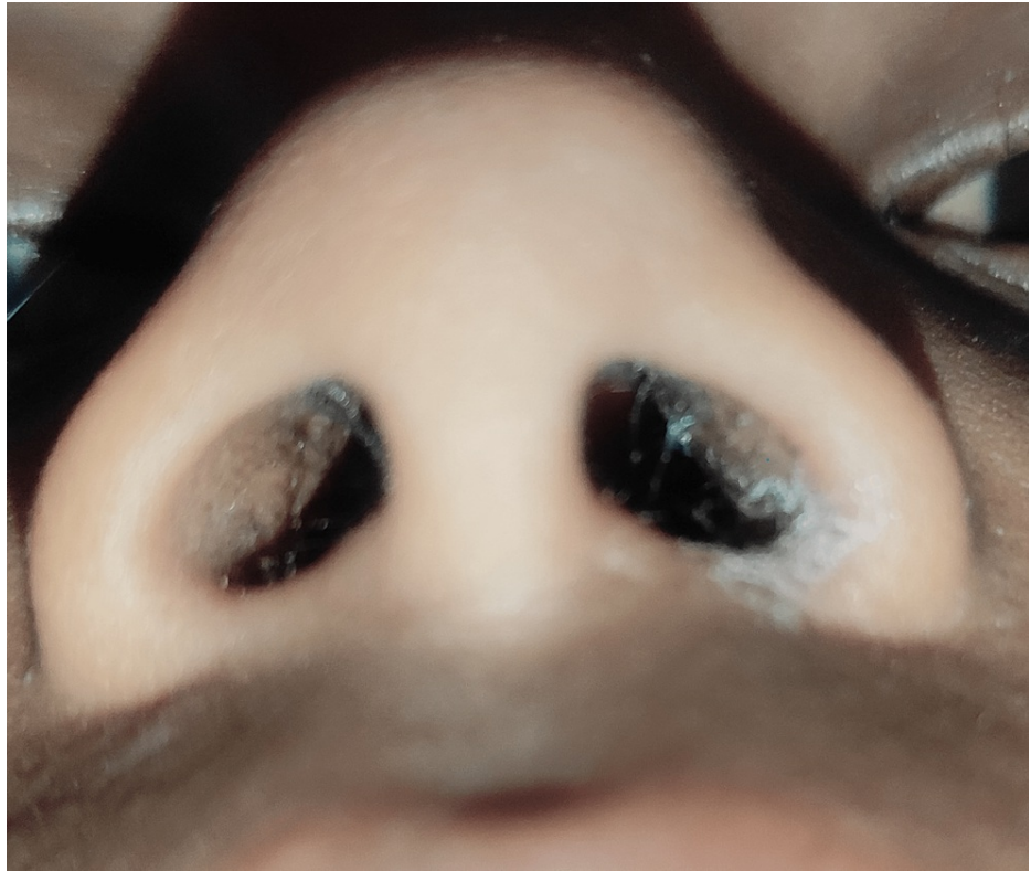
FIGURE 6: Post-treatment clinical photograph showing clear nasal passage in the left nostril