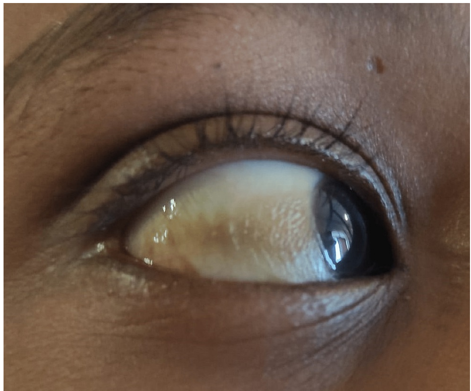
FIGURE 2: Bitot's spot

Bitot's spot is a triangular patch on the conjunctiva