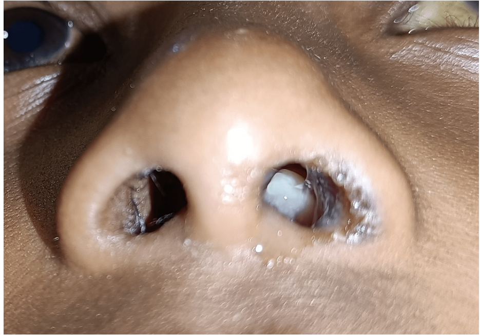
FIGURE 1: Whitish polypoid lesion in the left nostril with crustation on the left mucocutaneous region of the nose