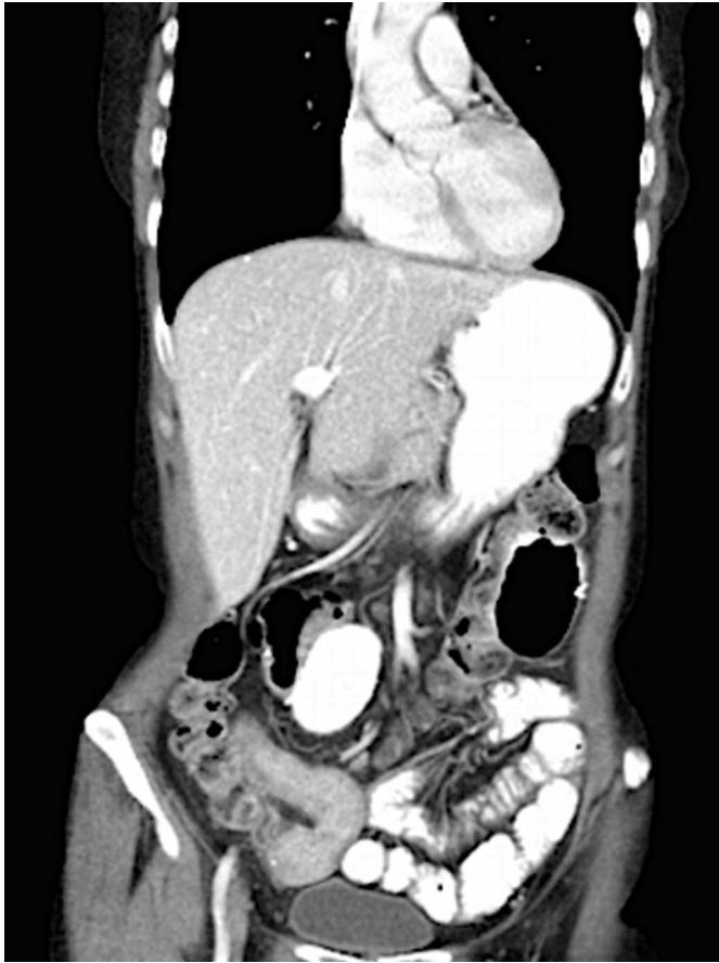
FIGURE 1. A representative photograph of a recent contrast-enhanced CT of the abdomen and pelvis. The distal small bowel demonstrates a significant amount of stricturing and some intestinal thickening.

epigastric discomfort, bloating, weight loss, and intermittent nausea but denies any vomiting. Her most recent CT scan in September of 2013 demonstrates a new distal ileum stricture with neoterminal ileum thickening and adjacent fat stranding (Fig. 1). A colonoscopy shows active Crohn's disease with stenosis in the distal ileum (Fig. 2).