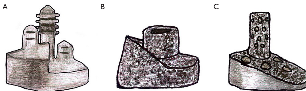
Figure 3 Augmented glenoid component designs. Artistic rendering of various augmented glenoid component designs (A-C). Augmented components include polyethylene designs utilized for anatomic TSA (A) and are made of metal baseplate components used in RTSA (B,C). All-polyethylene monoblock designs may be stepped as seen in panel A (DePuy Synthes, Warsaw, IN, USA) or include half or full wedges. Augmented metal baseplates may also either include a full, half, or lateralized design. An example of a half-wedge augmented glenoid is depicted in panel B (Wright Medical Group N.V., Memphis, TN, USA). In addition, augmentation may be posterior and/or superior, and an example of a posterior/superior augmented design is demonstrated in panel C (Exactech Inc., Gainesville, FL, USA). TSA, total shoulder arthroplasty; RTSA, reverse total shoulder arthroplasty.

augmented baseplates used in RTSA. A recent systematic review included nine studies (312 patients total) which used augmented glenoid components at a mean follow-up of 37 months (range, 2.3–72 months) (24). Overall, they found that 35% of patients had reported radiolucency surrounding the components with 44% rate of peg perforation in 5 mm augment stepped implants (24). While glenoid component augmentation is still developing a long-term track-record, larger studies are needed before widespread adoption in dealing with patients who have glenoid bone loss and an intact rotator cuff.