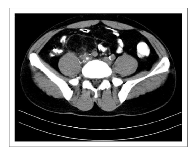
Figure 1. Axial image of the CT scan demonstrated a fatcontaining lesion with soft tissue component and calcification. Involvement of the right common iliac vessels is noted.

deep palpation in abdominal examination. Laboratory parameters were in the normal range. Abdomen and pelvic sonography showed an 8 cm mass in the retroperitoneum. Abdomen and pelvic computed tomography (CT) scan showed a solid fat containing lesion with soft tissue density component and calcifications measuring about 80*72*45 mm in RLQ (Figure 1). Abdomen and pelvic Magnetic resonance imaging (MRI) showed a well-circumscribed lesion with partial enhancement and fatty component. It was located adjacent to the right common iliac vessels, causing obliteration of the common iliac vein and encasement of the iliac artery (Figure 2). There was no diffusion restriction.