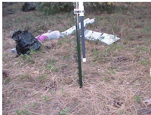
FIGURE 2. Close-up view of the ion exchange resin column in a typical winter installation.