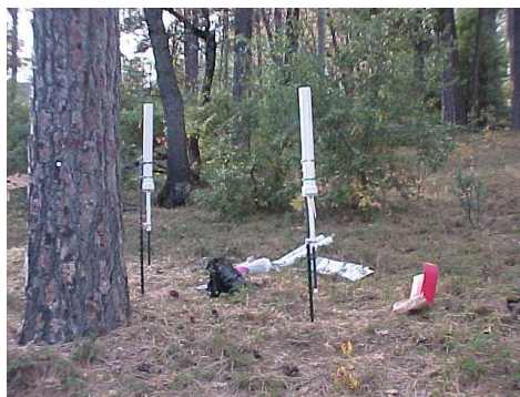
FIGURE 1. Ion exchange resin column throughfall collectors installed in the field. The smaller dark-colored tube at the bottom is the resin column. The large white cylinders at the top are the snow collector tubes. In summer, the snow collector tube is removed and a similar white cylinder is placed over the resin column to reduce direct exposure to solar radiation.

Both types of collectors were mounted on iron fence posts, with the collector opening ca. 1.5 m above ground level (Figs. 1 and 2). During snow-free periods all weather rain gauges (Productive Alternatives, Fergus Falls, MN) were used for the collection of throughfall for both types of collectors. The diameter of the funnel opening for these collectors is 10.0 cm [11,12]. An inert plastic screen (0.05-mm mesh size) was placed in the collector opening to exclude debris. Evidence of contamination from bird excrement, etc., was rare. During the summer, a white PVC cylinder (7.4-cm I.D.) was placed over the resin column to prevent direct solar exposure of the resin column. In winter, 7.4-cm diameter cylinders (1 m in length) were placed above the funnel collectors to allow for collection of snow. Fig. 1 shows the passive throughfall collectors with snow tubes attached to the top of the collector. Fig. 2 shows a close-up view of the bottom portion of the collector in winter (resin column is uncovered).