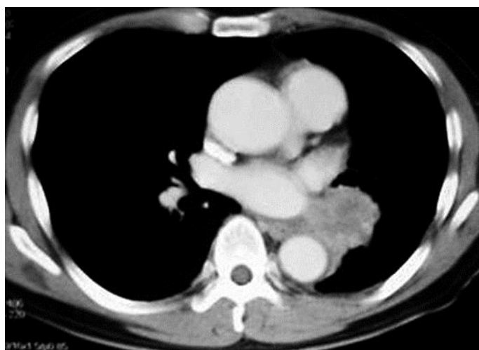
Fig. 2. Contrast-enhanced chest computed tomography revealed a solid lung tumor in the left lower lobe, and it invaded the inferior pulmonary vein to the left atrium.