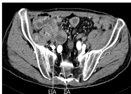
Fig. 2. Computed tomography one month after the surgical evacuation. The abdominal computed tomography scan shows a decreased amount of hematoma and a normal appearance of the left psoas muscle. EIA : external iliac artery, IIA : internal iliac artery, Il : iliacus muscle, Ps : psoas muscle.

warfarin was immediately discontinued and he was managed with pain control and regular neurological assessment. But, his pain and weakness were further increased over the next five days. He became unable to raise the left leg and to stand without assistance. Electromyography and nerve conduction study showed left femoral neuropathy. After confirming the normalization of his coagulation parameters, percutaneous catheter insertion was performed under ultrasonographic guidance for aspiration and drainage of the hematoma. However, only a small amount of the hematoma was drained and then surgical evacuation of the hematoma via the left retroperitoneal approach was