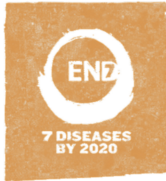
FIGURE 3. Logo of the END 7 campaign from the Global Network for Neglected Tropical Diseases of the Sabin Vaccine Institute. 34

To build on the successes for lymphatic filariasis, onchocerciasis, and trachoma elimination through MDA, beginning in 2005 several of us here this evening, together with the WHO and others, began to advocate for bundling MDA for these diseases with MDA for the soil-transmitted helminthiases and schistosomiasis. 9,18,32 Today, through such advocacy efforts along with safety data to support the simultaneous administration of albendazole, ivermectin, and praziquantel, 32 so-called “rapid impact” packages of donated and/or low-cost drugs are being provided through national programs of MDA for the seven of the most common NTDs, namely ascariasis, trichuriasis, hookworm, schistosomiasis, lymphatic filariasis, onchocerciasis, and trachoma. 4,33 Integrated NTD control and elimination efforts are now underway in almost 20 countries through the financial support of the United States Agency for International Development and their Neglected Tropical Diseases Program, 34 the British Department for International Development, 35 and the World Bank, as well as privately through a new END (“End