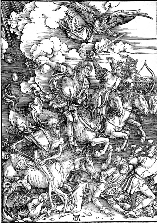
FIGURE 1. Woodcut of the Four Horsemen of the Apocalypse, ca. 1497–1498, Albrecht Dürer (German, 1471–1528).

especially helminth infections and trachoma, are chronic conditions affecting persons for years or even their entire lives. There are approximately 3–4 billion cases of tropical infections worldwide, but these diseases are disproportionately shared between the bottom billion. By this statement I mean that much of the bottom billion is polyparasitized and therefore infected simultaneously with several tropical diseases, such as hookworm with malaria, schistosomiasis, or strongyloidiasis; onchocerciasis with loiasis; and ascariasis with trichuriasis. 17 Moreover, certain tropical infections such as female genital schistosomiasis or malaria appear to increase susceptibility to human immunodeficiency virus/acquired immunodeficiency syndrome (HIV/AIDS). 17