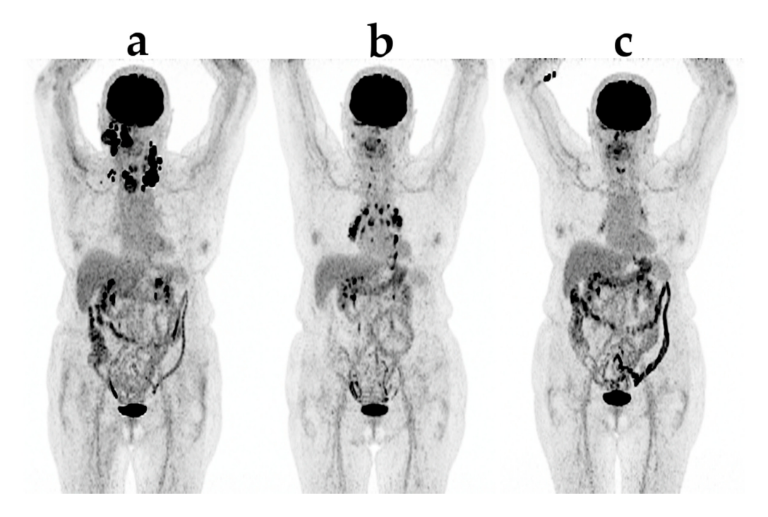
Figure 2. An example of new lesions appearing in an otherwise responding patient due to sarcoid-like irAE (immunerelated adverse event): (a) before treatment; (b) after three series of pembrolizumab; (c) after six series of pembrolizumab.