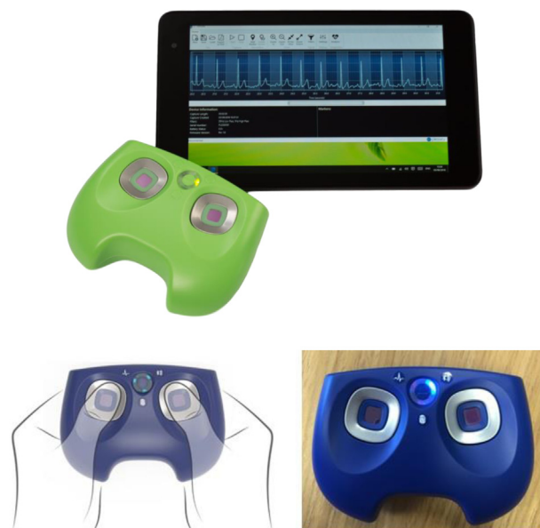
Figure 1 Appearance and mode of use of the imPulse device and tablet (Plessey Semiconductors Ltd, Plymouth, Devon, UK).

The Plessey imPulse device (Plessey Semiconductors Ltd, Plymouth, Devon, UK) is a new mobile lead I ECG device designed to detect AF (Figure 1). This study was undertaken to determine the sensitivity and specificity of this device in comparison to pulse palpation and a reference standard 12-lead ECG for AF diagnosis in a hospital setting.