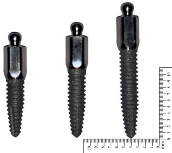
Figure 1. Straight ILZ MDIs from Southern Implants ® with a diameter of 2.4 mm. The length of the MDIs was 13 mm ( left ), 10 mm ( middle ), and 8.5 mm ( right ).