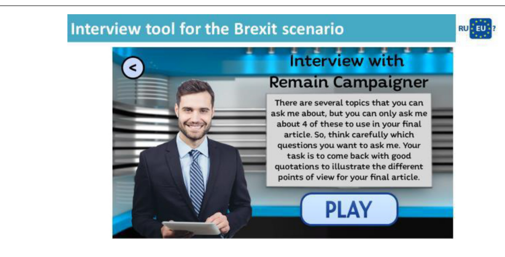
FIGURE 3 | A screenshot of the Interview tool with the Brexit scenario.