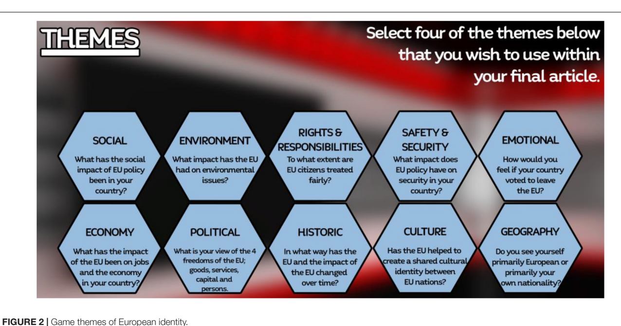
FIGURE 2 | Game thernes of European Identity.

has to select the 4 issues that he would most like to ask the pro and anti EU representatives about. When he has asked the question, the player is then shown the NPC's answer to the selected issues. For example the NPC might state that: "Freedom of movement has helped to create a much richer and more diverse society" or "If we vote to leave the EU, my company will go down the tubes." Each statement made by a NPC is coded with respect to whether it is pro or anti EU and which theme it represents. For example the first statement is coded as a pro EU "social" statement and the second as an anti EU "jobs and economy" statement. The selected statements are then transferred to the player's notebook where they are available for the player to choose in "writing" his article in the Final Assignment tool (Figure 4).