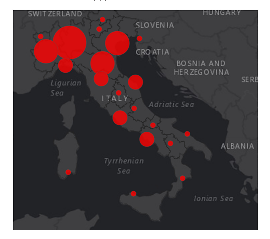
Figure 3 - Distribution of COVID-19 cases in Italy (3).

πεῖρα σφαλερή, ἡ δὲ κρίσις χαλεπή" "Vita brevis, ars longa, occasion praeceps, experimentum periculosum, iudicium difficile", we think residents should play an active role alongside the specialist by exploiting the pandemic as an unrepeatable opportunity from which to learn upon (22). In general, the COVID-19 emergency is a highly dynamic situation and the burden on the healthcare system varies daily according to the geographical region.