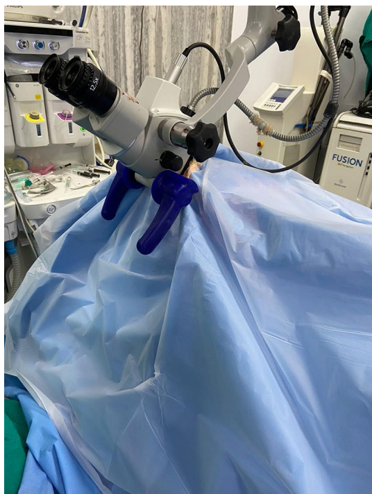
Fig. 2 The second drape fitted to the optical system of the operating microscope