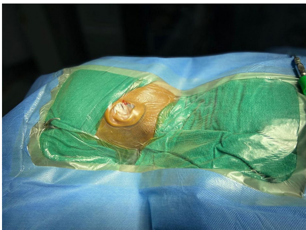
Fig. 1 The first drape firmly adherent to the surgical site