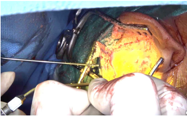
Fig. 5 Internal view of the closed pocket; Note the bone dust and irrigation fluid collected within the closed pocket