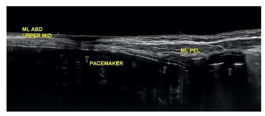
FIGURE 2. Abdominal ultrasound showing the pacemaker and cable immediately posterior to the abdominal wall in the midline abdomen and pelvis. No surrounding collection or tissue was found. ML ABD , Midline abdomen; ML PEL , midline pelvis.

Abdominal placement of the generator is usually achieved by creating a supra or submuscular space within the rectus sheath in the subcostal region. Supramuscular placement has an inherent risk of device erosion to the skin, especially in small children with a thin subcutaneous layer. Contrary to supramuscular placement, submuscular placement might be complicated by herniation through the posterior fascia into the abdominal cavity, potentially causing a myriad of abdominal presentations that range