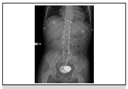
Pacemaker sitting in the pelvic cavity, stretched cable and epicardial pacing wires.

Abdominal examination revealed a soft and lax abdomen. The device was not palpable in the abdomen nor the lower pelvis, and there was no tenderness nor skin changes. All routine blood work was within normal limits, including inflammatory markers. An abdominal radiograph showed the device located in his lower abdomen