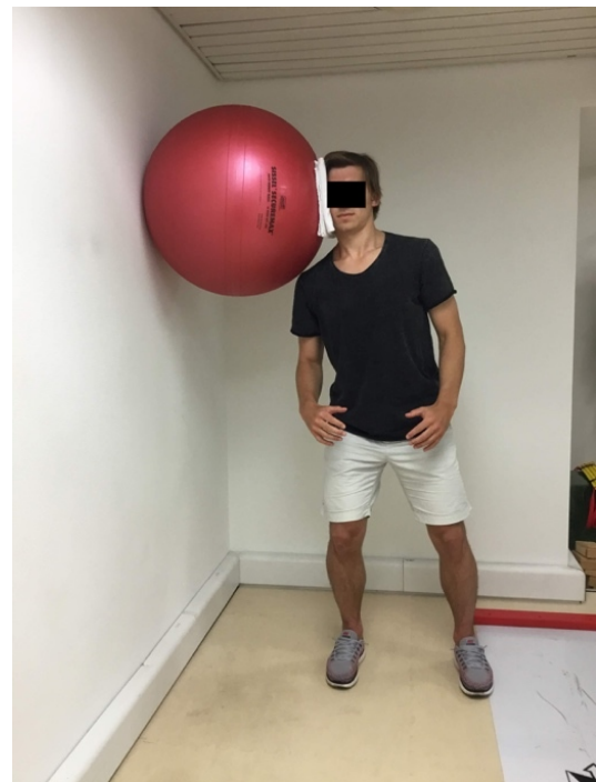
Figure 4. Isometric neck stabilization (lateral muscles) against a Swiss ball (duration/sets to be adapted) – Stage 3 (Table 2)