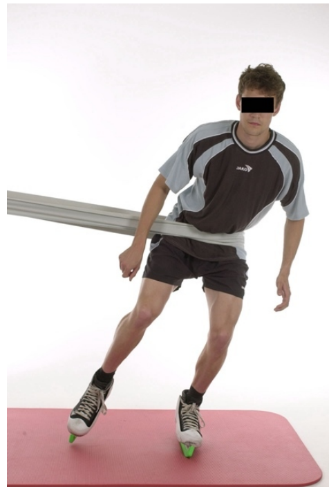
Figure 1. Reactive balance/stabilization on skates and against elastic resistance (duration/sets to be adapted)

Deficient (or insufficient) activation of the deep cervical muscles is a common clinical observation in athletes after SRC, 14 and it is therefore recommended to implement a neck stabilization/strengthening scheme in the RTS program usually during Stage 3 when SRC symptoms gradually resolve (Figure 4, 5). Despite the controversy surrounding