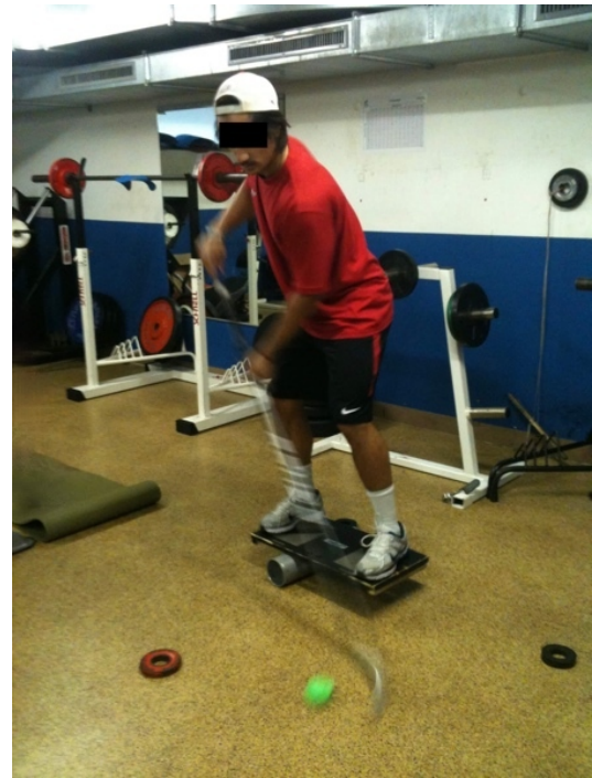
Figure 2. Balance/stabilization on board with stickhandling and moving the puck between two plates (duration/sets to be adapted)

Sport-related concussion is a severe and complex type of injury requiring specific rehabilitation management and a