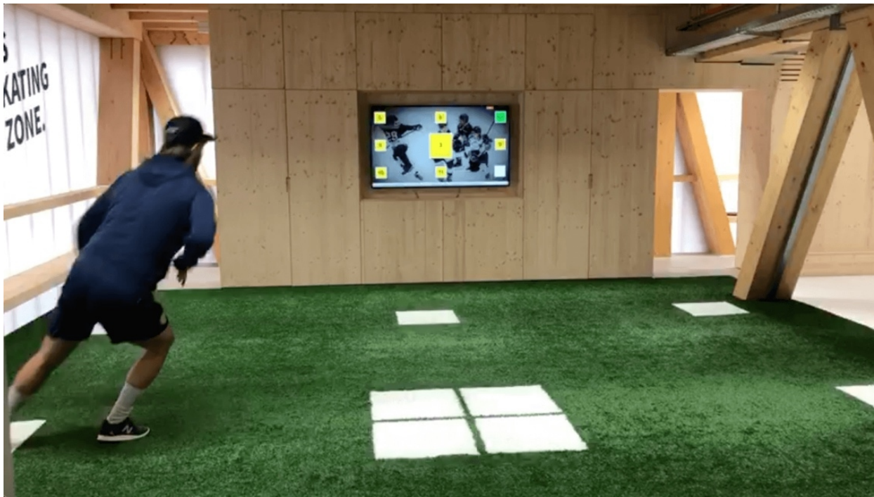
Figure 7. Visuomotor reactive training on the “Speed Court” (GlobalSpeed GmbH, Hemsbach, Germany). The player moves quickly form plate to plate reacting to the given signal on the screen placed on the wall in front of him. Drills of about 20-30-40 sec duration (sets to be adapted).