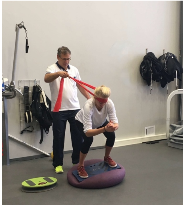
Figure 5. Reactive neck stabilization against elastic resistance, on an instable surface (duration/sets to be adapted) – Stage 4 (Table 2)