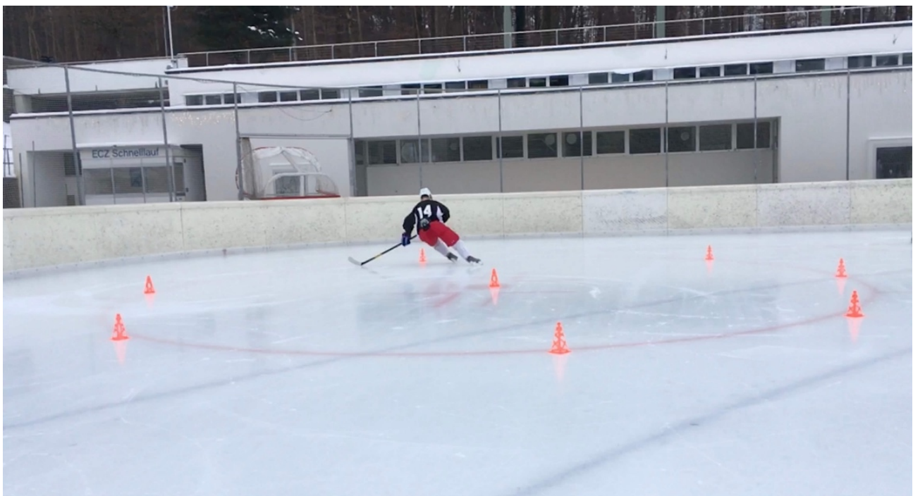
Figure 8. Several cones on the bully circle line and one in the middle. Player skates quickly and randomly between cones (stick/stick and puck). Progression: Fitlights are placed on the cones, and the player skates quickly to the cones reacting to the given light signal (stick only). Drills of about 20-30 sec duration (sets to be adapted)