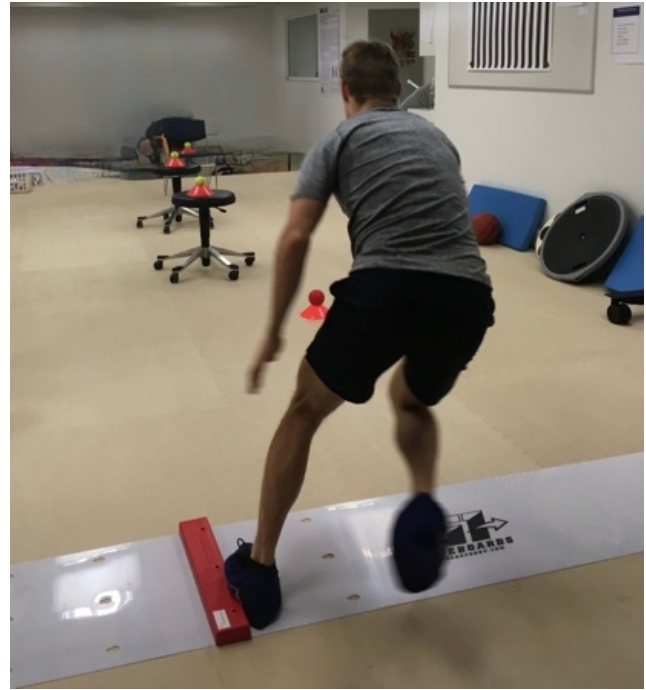
Figure 3. Moving on the slide board with an oculomotor task (fixing objects at various distances) (duration/sets to be adapted)

Submitted: August 27, 2021 CST, Accepted: November 12, 2022 CST