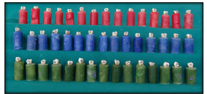
Figure 1: Group 1, Group 2, Group 3 after bonding of molar tubes