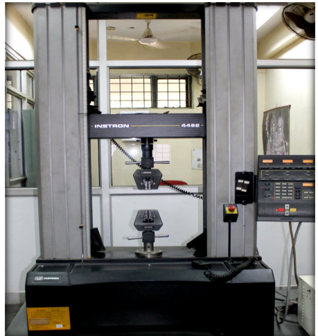
Figure 2: Instron Universal Testing Machine

the adhesive was light-cured at a distance of 5mm for 10 seconds on each side (mesial, distal, occlusal and gingival). To avoid any variation, a single operator handled all procedures (Figure 1). The specimens after bonding were stored for 24 hours at 37°C in distilled water.