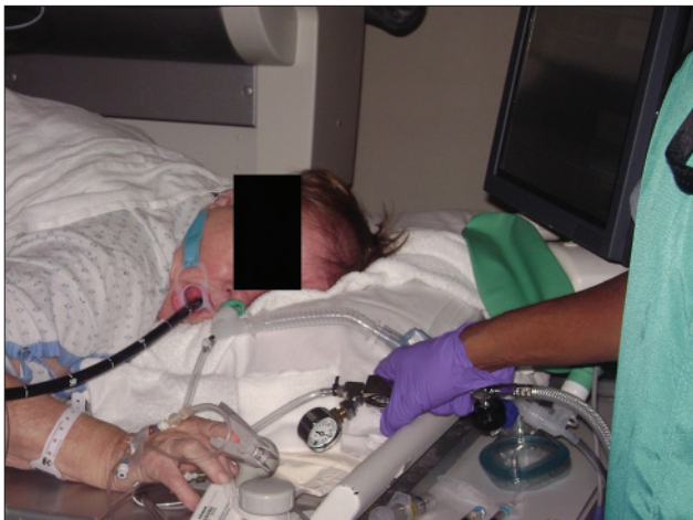
Figure 4: CO 2 out port of an elbow adapter used to deliver supraglottic jet ventilation via nasal trumpet during an endoscopic retrograde cholangiopancreatography

The dose of propofol is controversial in morbidly obese patients. [7,8] All dosing methods have one aim, to predict the