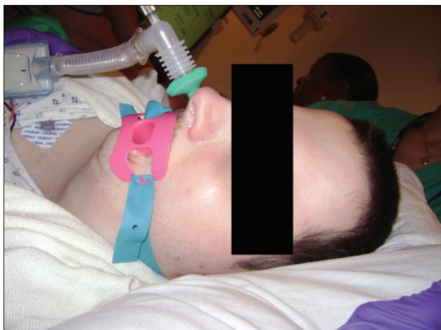
Figure 3: A size 32 nasal trumpet connected to mapleson-C breathing system

EGD=Esophagogastroduodenoscopy, LMA=Laryngeal mask airway, ERCP=Endoscopic retrograde cholangiopancreatography, SD=Standard deviation