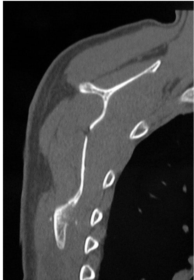
Figure 4 Postoperatively, CT reveals the complete resection the tumor.

In order to safely achieve complete tumor resection through a small incision, the most important factors are the location and the number of the portals. Ruland et al. , [14] described the relation of major neurovascular structures to safe portal sites based upon a cadaveric study. The authors recommended that the portals should be inferior to the spine of the scapula to avoid the neurovascular structure at the superomedial angle. In addition, an area of three to four fingerbreadths from the medial border of the scapula is required to avoid the dorsoscapular nerve and artery. Harper et al. , [6] applied the method of Ruland [14] to treat one case of an osteochondroma located at the superomedial angle. On the other hand, in the case of Kumar [5], the portal was made at the lateral aspect of the scapula and through the axillar region to treat the osteochondroma at the superomedial angle. A portal by the lateral approach has the advantage of not being in close proximity to major neurovascular structures. In addition, only one muscle, the teres major, needs to be partially sectioned. In the present case, the tumor was located inferior to the spine of the scapula. Only one lateral portal was