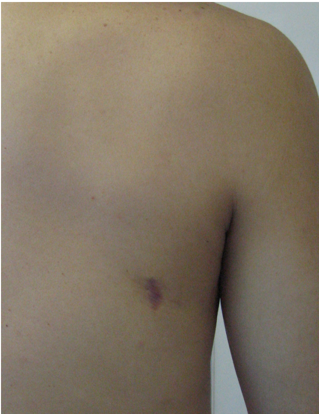
Figure 6 The small scar, 2 cm in length, can be seen in the lateral aspect of the right scapula.