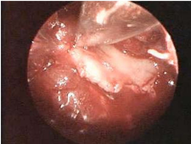
Figure 3 Endoscopic image shows that the tumor was removed by use of a grasper.

case of a chondroblastoma of the femoral head in 1995 [12,13]. Of osteochondromas, only one in the distal femur [7] and only 2 in the scapula have been reported [5,6]. The authors emphasized the superiority of endoscopically assisted tumor resection to the traditional surgical treatment [5-7]. By the use of endoscopy, the size of the incision, the amount of sacrificed soft tissue, and the blind areas can be efficiently reduced. Thus, the entire tumor resection is achieved even through a small incision. Consequently, the patient can obtain an early functional recovery and a cosmetic advantage.