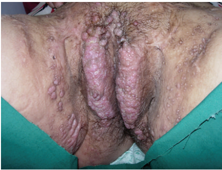
FIGURE 2: Widespread papules and vesicles on the pubis, labia majora, and inguinal region.