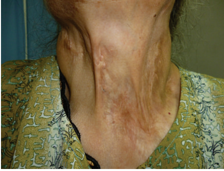
FIGURE 1: Scar tissue forming constrictions on the neck.