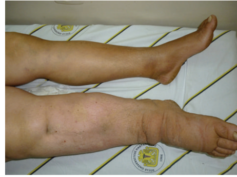
FIGURE 3: Nonpitting edema of the right leg and foot.