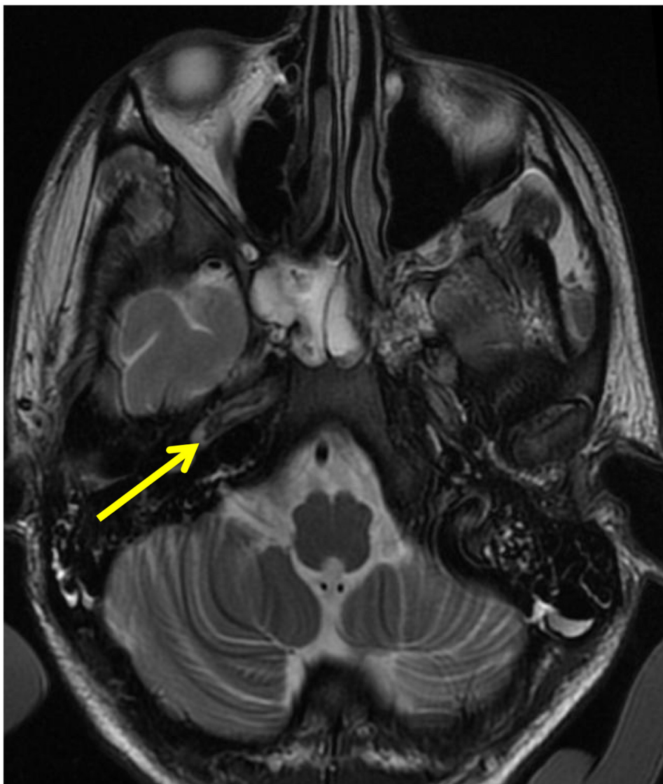
Fig. 2. Axial T2 weighted image of the skull base showing loss of normal flow void (arrow) within the petrous segment of the right internal carotid artery indicative of internal carotid artery occlusion.

one could argue that routine imaging could have been conducted earlier. The pathological process is more common in polytrauma, especially if there are injuries sustained to the head, neck or cervical spine and therefore there needs to be a high index of suspicion in this group of patients. Signs of spinal injury may mimic or disguise the clinical features of vertebral artery dissection and therefore early CT angiogram and/or Doppler and duplex ultrasonography should be used as a non-invasive screening tool in patients with significant traumatic injuries [9]. Early anticoagulation should ideally be the treatment, however, in traumatic injuries it is seldom used. Young age and ischaemic strokes favour better outcomes [10]. This informs and adhered to good clinical practice guidelines.