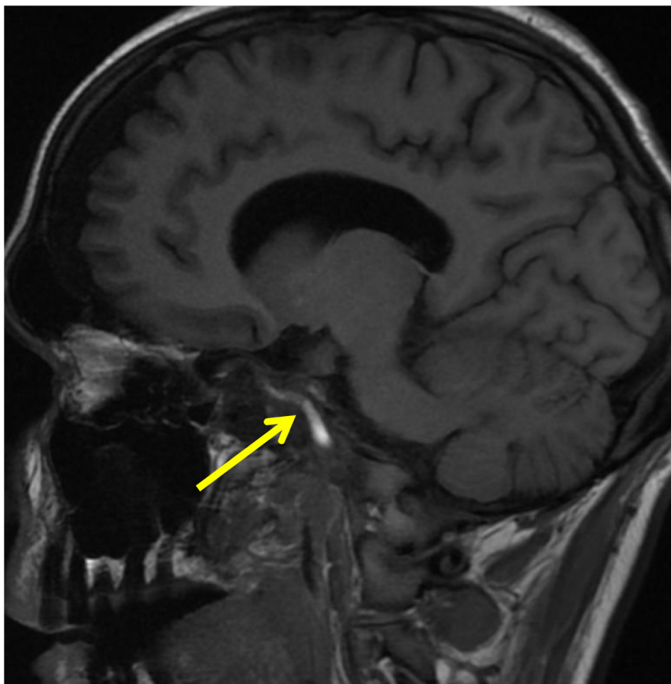
Fig. 3. Sagittal T1 weighted image of the head showing T1 high signal (arrow) suggestive of the periluminal hematoma from the occluded right internal carotid artery.