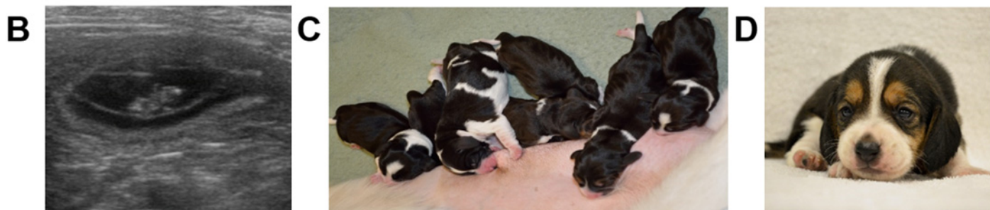
Fig 3. Results of transfer of IVF embryos. (A) Embryo stage, status, transfer location and the results of IVF-derived embryo transfers. (B) Ultrasound image of a normally-developing embryo imaged Day 29 from Transfer #5. (C) 7 healthy puppies were born by planned Caesarian section. (D) Normally developing beagle puppy at 3 weeks of age.