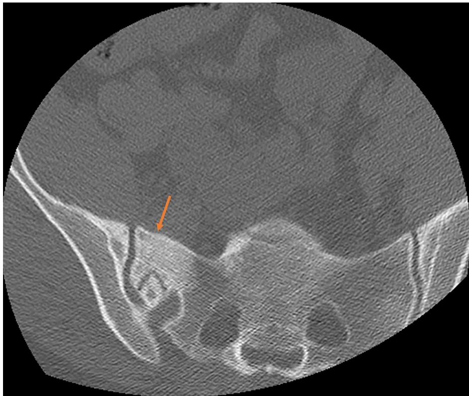
FIGURE 2: Axial CT scan of the sacrum.

Axial CT scan of the sacrum showing hyperdensity of the right sacroiliac region (arrow).