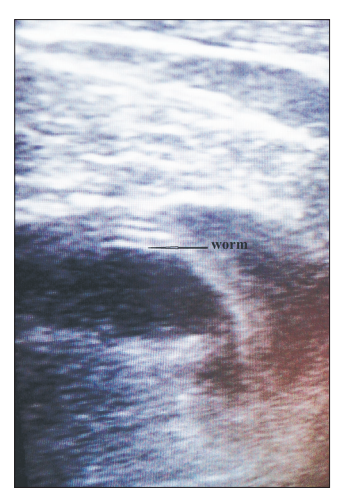
Figure 1: Ultrasound (curve probe) showing Ascaris worm in the bowel loop as a parallel echogenic structure