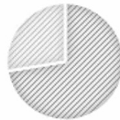
FIGURE 2: Age distribution of patients in the study