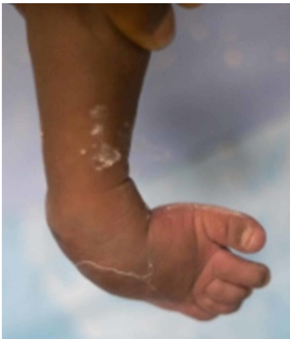
FIGURE 1: Clubfoot cavus presentation

Clubfoot can be diagnosed based on visual inspection as soon as the child is born (Figure 1). A total of 1,634 patients (including 615 males and 1,019 females) were treated during the year 2015. In 2015, 872,000 births occurred in Ghana. Because all of the newborns in Ghana with clubfoot were not included in the CURE registry, the exact prevalence of clubfoot in Ghana during 2015 could not be determined. In the CURE registry, 72.4% of patients were younger than one year, and 27.6% of patients were older than one year at age of treatment (Figure 2). Also, 16.2% had less than eight casts and 82.6% had greater than eight cases prior to tenotomy and bracing; 74% had a percutaneous, Achilles tenotomy prior to the final cast placement (Figure 3). Twenty-six percent of feet were supple and corrected without the need for a tenotomy. There was a range of ages at which treatment was initiated from newborn to five years old. Finally, 1.2% of patients returned within one year due to a relapse in clubfoot following a complete Ponseti treatment protocol.