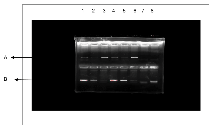
Figure 2 Agarose gel electrophoresis for blaNDM-1 gene (475 bp). Notes: Lanes 1, 3, 4, and 6 (A) and lanes 1, 2, 4, 5, and 8 (B) are positive for blaNDM-1 gene. Lanes 2, 5, 7, and 8 (A) and lanes 3, 6, and 7 (B) are negative. Abbreviation: blaNDM, New Delhi metallo-β-lactamase.

Continuous variables were described as median and categorical variables were described as n (%). For comparative tests on continuous variables, Mann—Whitney U test was applied. For categorical variables, Pearson's chi-squared test or Fisher's exact test was used as appropriate. Statistical analysis was performed using the SPSS-17 software (SPSS Inc., Chicago, IL, USA). P<0.05 was considered significant.