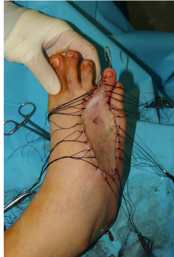
Figure 4 Approximation of the harvested full thickness skin to the defect area using silk 2-0 sutures.