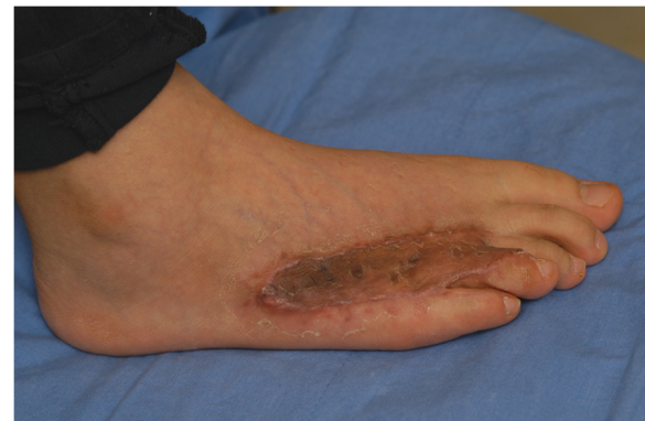
Figure 5 Postoperative 2 months.

All statistical analyses were conducted using PASW version 18.0 (IBM, Armonk, New York, USA). Our data