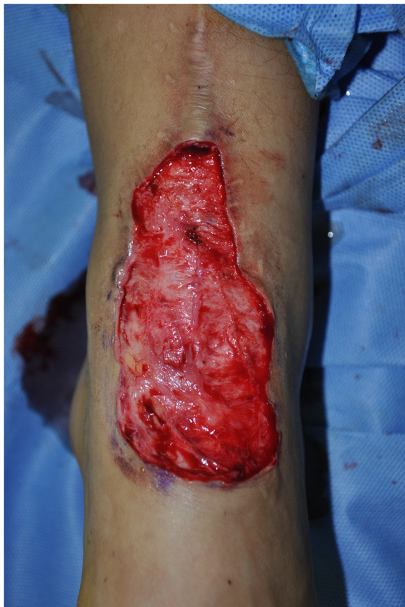
Figure 7 A representative shape of the defect following complete excision that could not be closed primarily.

As defects after excision usually ranges from 3×6 to 10 × 15 cm in size, it cannot be closed primarily (Figure 7). As we usually have 2-3 mm additional surgical free margins, we routinely harvest full thickness skin to completely cover the defect. Split thickness skin grafting can increase secondary contracture, while using flaps and neglecting the lower step on the reconstructive ladder can expose