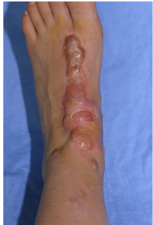
Figure 2 Typical ulceration in a foot keloid.