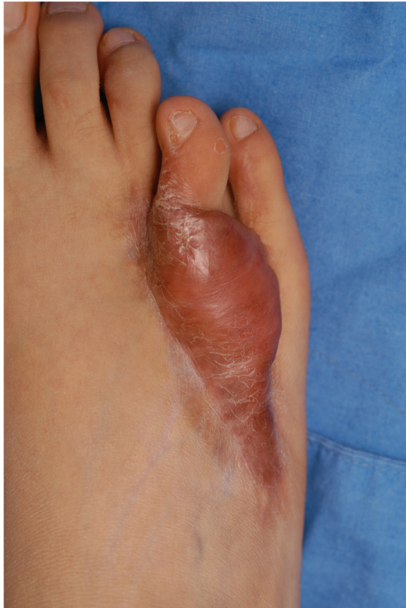
Figure 3 Preoperative appearance of a patient.