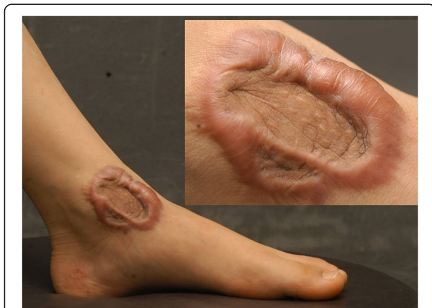
Figure 1 Central sparing in a foot keloid.

Patients were treated with surgical excision followed by full thickness skin grafting combined with postoperative steroid injections combined with silicone gel sheeting over a period of eight years from December 2004 to November 2012 at Kangbuk Samsung Hospital, Seoul, Korea. Patients with foot keloids admitted to our institution for surgical therapy were included in the present study based on several criteria: 1) the presence of clinically definite keloid scars on the foot dorsum; 2) scheduled for a complete surgical excision with full thickness skin grafting; 3) the patient can understand and comply with adjuvant corticosteroid injection therapy. Patients were excluded from the study if they were unavailable for follow-up or if histological confirmation was not obtained. All patients consented to a final follow-up visit 12 months after treatment. We analyzed data including patient age, total size, gender, etiology, previous treatment history and modality, recurrence, and clinical photographs.