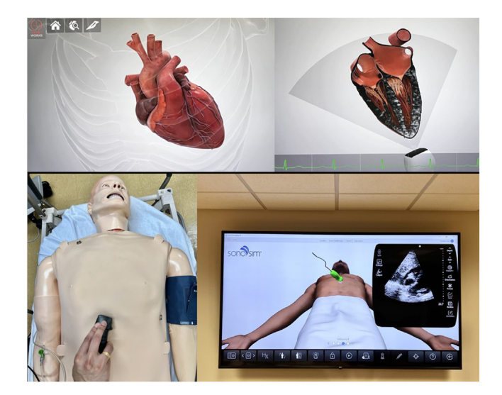
Figure 1. Images obtained during the workshop using Heartworks augmented reality portable simulator demonstrating cardiac anatomy ( upper panel ) and SonoSim ultrasound simulator with manikin demonstrating the probe position and corresponding ultrasound image. Pericardial effusion is seen in this photograph ( lower panel ).

workshops for small groups of students focusing on basic cardiac and lung ultrasound and pursued this study to gauge the effectiveness of this initiative.