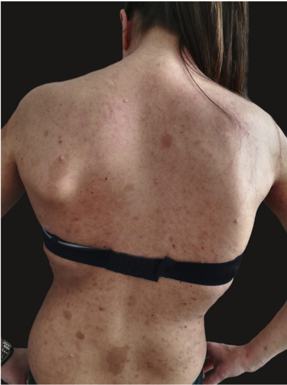
Figure 1 Clinical signs of type 1 neurofibromatosis and atopic dermatitis. Eczematous lesions, with erythema, oozing and crusting, several cafe au lait spots, freckles, cutaneous neurofibromas.