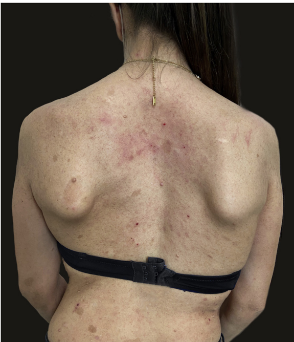
Figure 2 Remission of atopic dermatitis after 4 weeks of treatment with dupilumab. Residual eczematous lesions, as seen on the neck, determined an EASI score of 4.