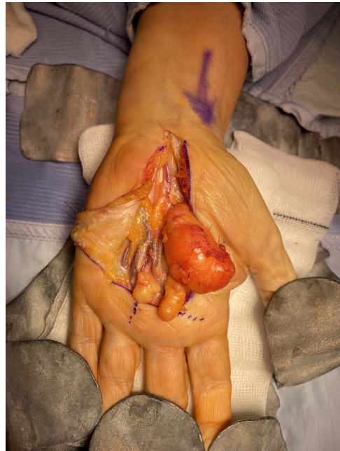
Figure 3. Intraoperative images demonstrating the relationship of the lesion with the surrounding neurovascular structures.

Histopathological analysis of the soft-tissue lesion revealed sections showing lobules of mature adipocytes, consistent with a diagnosis of lipoma. There were no features of malignant change. The patient was seen in our hand dressing clinic 3 days postoperatively, whereupon the drain was removed, and wound was