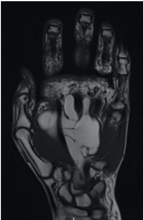
Figure 2. Coronal section demonstrating small proximal extension into carpal tunnel with resultant median nerve compression.

incision was considered and marked pre-operatively. However, this was ultimately not required, as adequate access was achieved using the volar approach to excise the entirety of the lipoma. A multi-lobulated, encapsulated fatty lesion was found in the central palm extending to the carpal tunnel and the dorsal sub-aponeurotic space, involving the third inter-metacarpal space and flexor tendons. The tumour was successfully resected en bloc whilst protecting all tendons and neurovascular structures. The excised lesion measured 12 \times 7 \times 2.4 cm (Fig. 4). After excision, satisfactory haemostasis was achieved; drain inserted and skin closed using absorbable sutures. No immediate postoperative complications were noted.