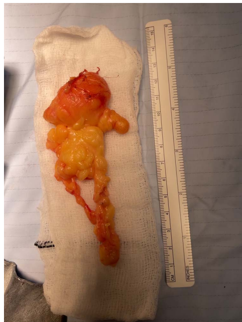
Figure 4. Final specimen measuring 12 \times 7 \times 2.4 cm.

noted to be healing well. At the 1-month postoperative review, the patient reported complete resolution of paraesthesia with partial functional recovery including improvement in mobility of all digits and grip strength.