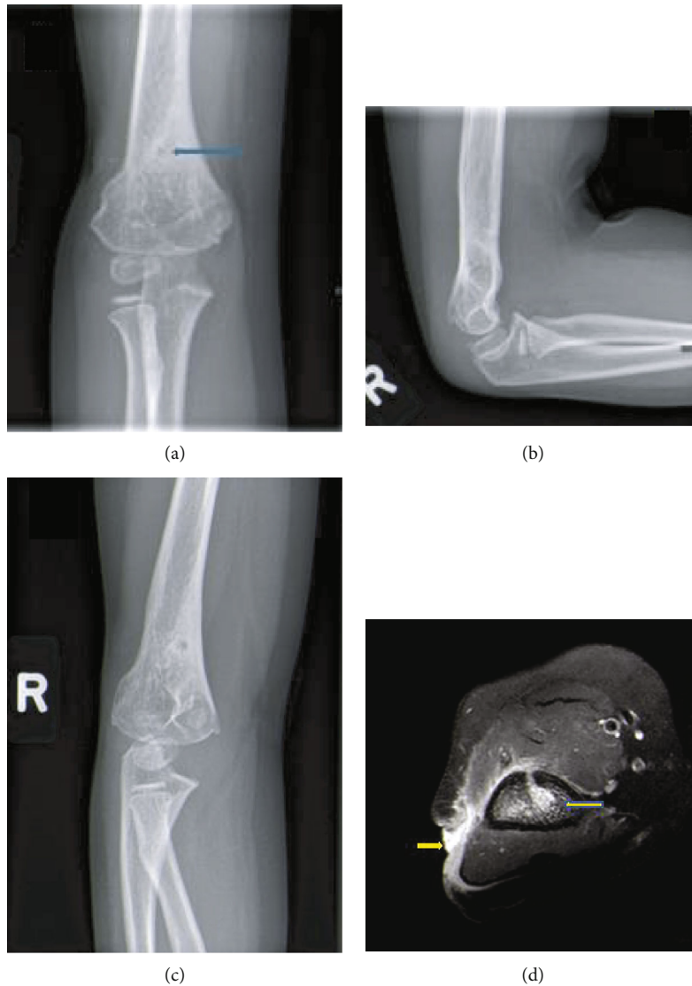
FIGURE 1: (a–c) AP, lateral, and oblique MRI of the right elbow with a subtle area of lucency (arrows) in the metaphysis. (d) Axial T1 postcontrast MRI with an enhancing lesion (large arrow) in the bone with anterior cortical disruption and enhancement anterior to the humerus extending to the lateral sinus tract (small arrow).

While a draining wound in this scenario necessitates culture of the drainage and imaging for the investigation of potential osteomyelitis, the presentation of a delayed pin-site infection can be varied and much more indolent [11]. Case 2 had only vague atraumatic elbow pain without any sort of draining wound or skin changes on initial examinations. The range of symptomatic presentations in this case series suggests that the diagnosis of delayed pin track infection with late-onset osteomyelitis should be suspected in the setting of pain, swelling, or drainage at the site of a previous fracture. Imaging studies aid the diagnosis of infection. Pin tracks typically result in a sclerotic appearance due to deposition of new bone, and an area of lucent ring sequestrum is indicative of bone destruction and is highly suggestive of infection [6, 12]. Preoperative advanced imaging like CT and MRI further aid the diagnosis of infection and are useful for isolating possible foci of infection in surgical planning.