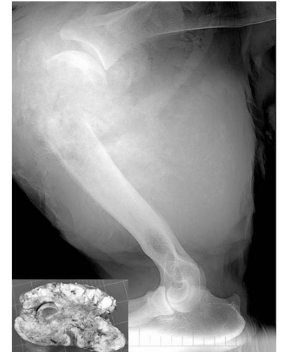
Fig. 1. Mediolateral radiograph shows a destructive bone lesion with pathological fracture of the proximal third of the humerus. The tumor is densely sclerotic, containing a considerable amount of mineralized osteoid. Small picture in the inset shows gross appearance of the osteosarcoma, with destruction of the cortex and a soft tissue mass with osteogenic white areas.

right shoulder, elbow, and humerus, and a lateral view of the thorax were obtained. The area over the proximal humerus was clipped and surgically prepared to obtain a fine needle aspiration (FNA) for the cytological evaluation of the mass. Radiographs of the limb showed an osteolytic sclerosing lesion with irregular rim, mild periosteal reaction and irregular cortex, intramedullary extension and pathologic fracture of the metaphyseal area, severe invasion and complete detachment of the right humeral epiphysis (Fig. 1).