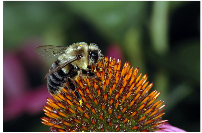
FIGURE 1 A common eastern bumblebee, Bombus impatiens , worker foraging on purple coneflower ( Echinacea sp.).

Several studies in mixed environments have identified the importance of landscape as a driver for bee diversity and habitat quality. For example, sampling twelve sites in urban, seminatural, and agriculture areas in France, Geslin et al. (2016), discovered that “urbanization”—quantified as proportion of impervious surfaces within a site—was negatively associated with bee abundance and species richness. Similar patterns were observed within farms and gardens in the greater Chicago metropolitan area (Bennett & Lovell, 2019). Using genetics to infer the location and density of bumblebee colonies, Goulson et al. (2010) discovered that the size and number of gardens within agricultural landscapes had positive effects on the survival of two bumblebee species in the UK. Another UK study carried out in agricultural landscapes found that forage patches sown with flower mixtures had a positive influence on bumblebee species richness and worker densities (Carvell et al., 2011). Jha and