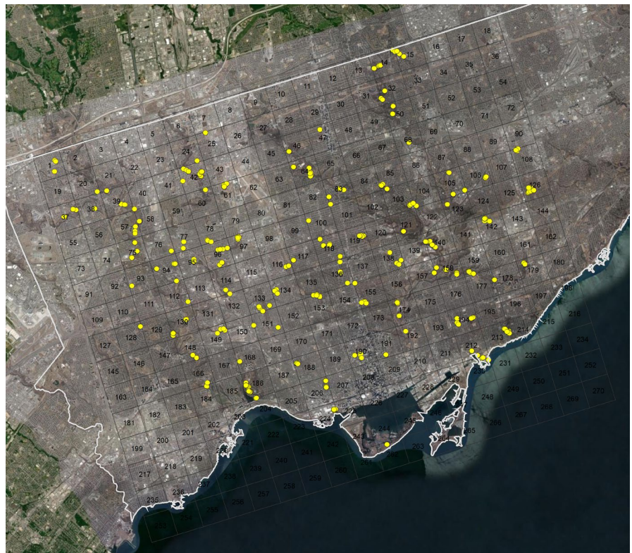
FIGURE 2 Map of the City of Toronto showing 2 \times 2 km grid cells and bumblebee sampling sites. Sampling locations are represented by yellow circles. Please see SI Dataset 1 for exact sampling coordinates

The city of Toronto (Ontario, Canada) was divided into 270 grid cells, each measuring 2 \times 2 km ( 4 \text{ km}^2 ) (Figure 2). Grid cells were selected at random and visited for sampling between July and October 2016—this period is within B. impatiens ' worker activity period in Southern Ontario (Colla & Dumesh, 2010). In total, we collected 760 specimens from 86 grid cells, across 27 collection days (Data S1). At the start of a collecting day, a random number generator was used to pick a focal grid cell for sampling. We typically traveled within a grid cell and netted flying bumblebees as they foraged on flowers. While we tried to sample bees from many different locations within a grid cell, this was not always possible in highly urbanized areas where green space (and flowers) is sparse. After field identification, B. impatiens workers were collected and kept in a cooler. After either 2 h or approximately 60 specimens were collected from a single grid cell, the collector would then move to an adjacent grid cell for collecting. This process of visiting adjacent grid cells helped us maximize the number of grid cells sampled in a given day by minimizing travel time. At the end of the sampling day, bees were transported to York University's Keele Campus and stored in a deep freezer at -80^\circ\text{C} .