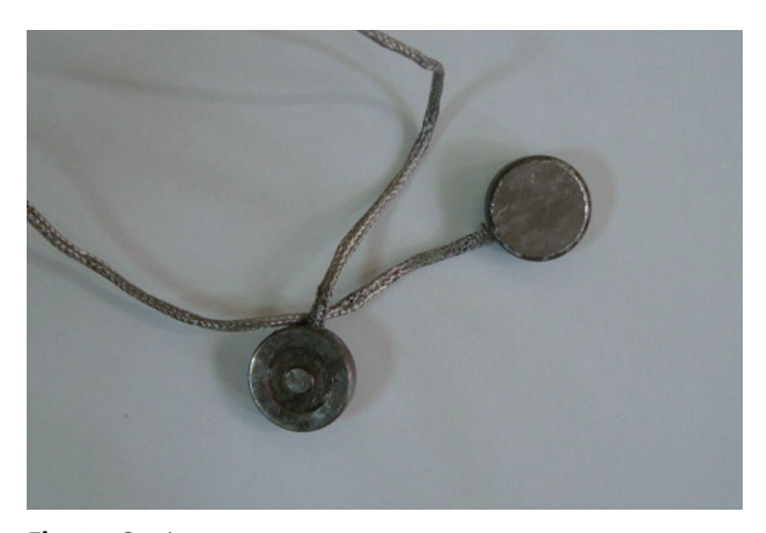
Fig. 3. Strain gages.

During the test, participants were seated in an upright position with the head in a natural posture, keeping the Frankfort horizontal plane approximately parallel to the floor. Initially, bilateral transducers that positioned on the