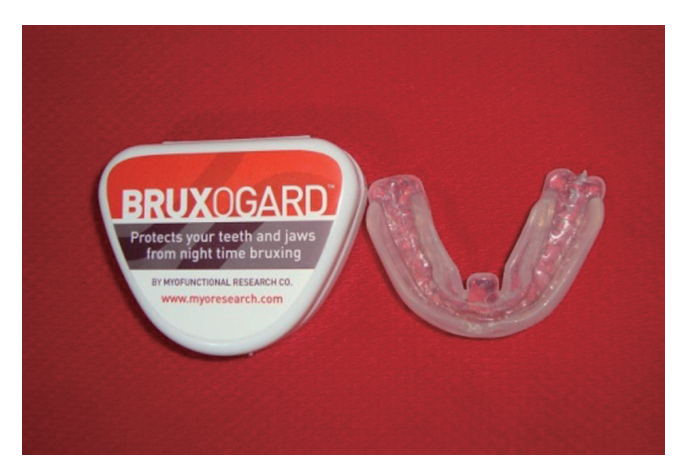
Fig. 2. Broxogard Soft splint.

avoid contamination during measurements. Each transducer has a height of 4 mm and a diameter of 12 mm; with these applications transducers reached a height of 6 mm. Occlusal force was detected as a two-channel signal from each side with a bio-signal acquisition device designed by Kardiosis (Tepa Inc., Kardiosis Ltd., Ankara, Turkey). The force signals were monitored online and then measured on a computer screen as kg (kilogramme), using a specific software program developed by the same company. The calibration of the transducers was performed by loading the transducer with known force values, the deviation from linearity with a load of 5 kg was + 2.66% in right transducer and + 4% in left transducer, 15 kg was + 5.2% in right transducer and + 2.6% in left transducer.