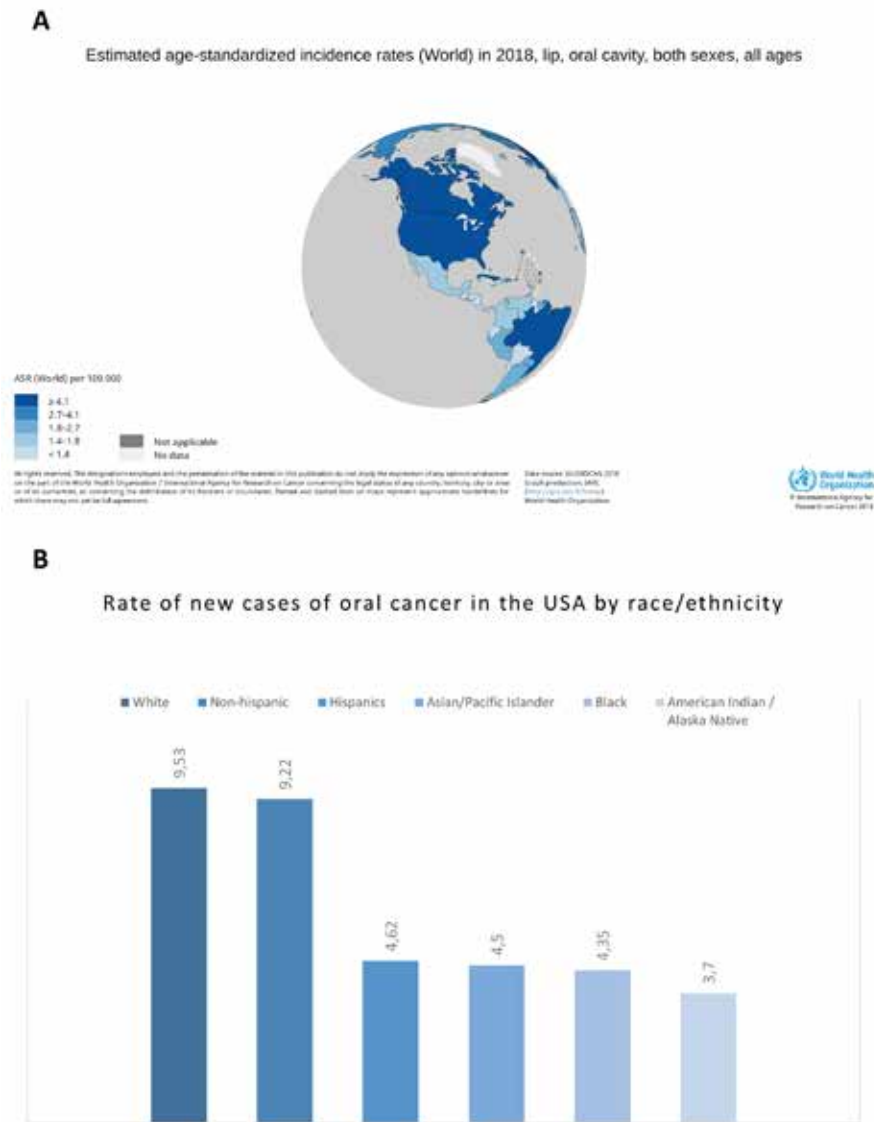
Fig. 3: Incidence rates of oral cancer. A) Worldwide, see the differences between Mexico (1.5) and USA (4.3) (WHO, 2018); B) By race and ethnicity in the USA population (NIH, 2017).