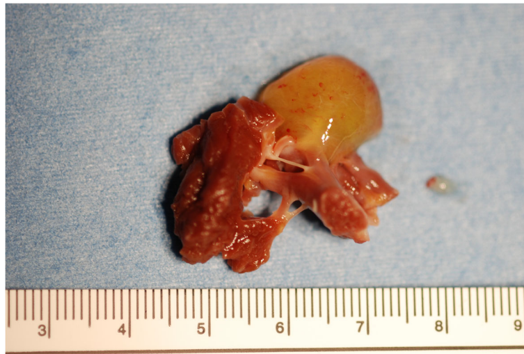
Fig. 2 Macroscopic findings of the resected specimen. The tumor originated at the trabecular muscle. A good surgical margin (>5 mm) was achieved

ventricle or postoperative ventricular arrhythmia, this approach provides a good surgical view that enables excision of both the tumor and its stalk in an en bloc fashion.