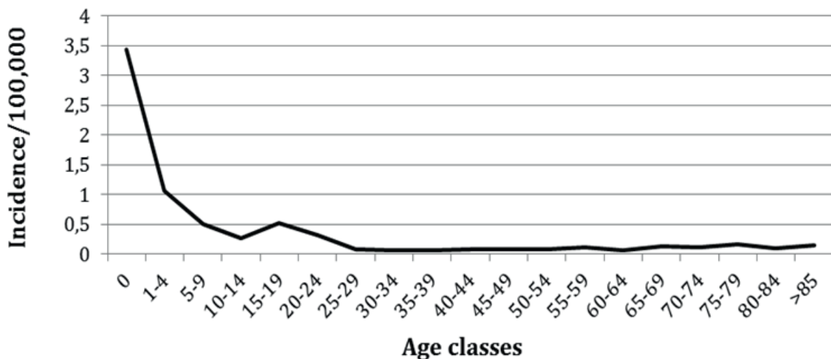
Fig. 2. Estimated incidence of invasive MenB disease in Italy, 2007-2012 (data from reference 16).

Carrier status has been studied and even more in depth understood during last years, in particular after the implementation of immunization with MenC conjugate vaccine