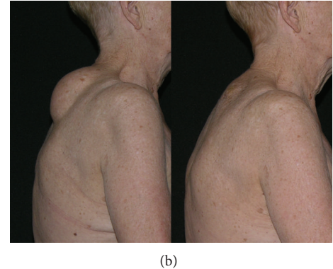
FIGURE 1: Pre- and 1-month postoperative photographs of an 80-year-old woman with 15 \times 13 cm lipoma. (a) Back view and (b) right lateral view.