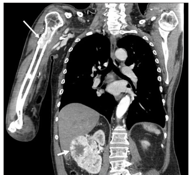
Figure 2: CT of thorax and abdomen: Enhancing lesion at the site of the fracture (long arrow). Exophytic mass at the mid and lower pole of the right kidney (short arrow).

mid and lower pole of the right kidney was also demonstrated ( Figure 2 ). Findings were in keeping with a renal cell carcinoma (RCC) with hypervascular bone metastasis resulting in a pathologic fracture, which demanded intramedullary nailing. Because of significant risk of operative bleeding from the bone metastasis, an angiography with endovascular embolisation was performed. On angiography, at least three feeding branches arising from the axillary artery to the bone metastasis at the fracture site were identified ( Figure 3A ). Due to extensive venous shunting, particles could not be used for embolization. The feeding vessels were embolised using coils ( Figure 3B ). Surgery on the fracture was subsequently performed with no notable bleeding.