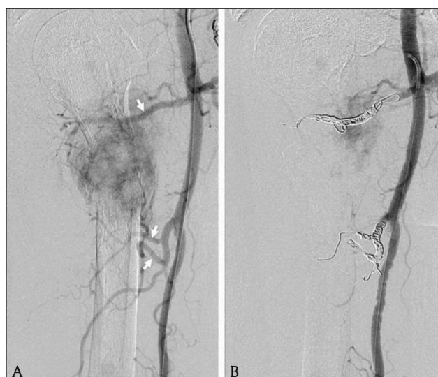
Figure 3: Angiography. 3A: Three feeding branches (arrows) arising from the axillary artery to the bone metastasis. 3B: Endovascular embolization of the feeding branches with coils.

radiotherapy, with variable results. In the past few years, interventional radiology (IR) has taken up an increasing role in the management of bone metastasis. IR can be used as a curative treatment in selected patients with oligometastatic disease or as palliative strategy, most often as pain relief. IR offers several advantages, such as a synergic effect with all other treatments, no need for interruption of systemic tumour therapy, reduced morbidity and in-hospital stay, and fast recovery. The decision to perform an IR procedure in a patient with bone metastasis has to be taken in consensus by a multidisciplinary tumour board. Most common IR procedures of