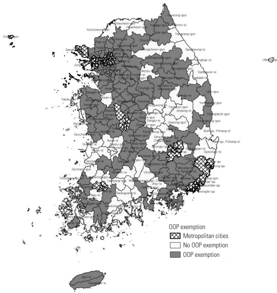
Figure 2. Out-of-pocket payment (OOP) exemption.

The current status of OOP exemption policies for the elderly in regions other than metropolitan cities in Korea is shown in Figure 2. Most of these regions have implemented these poli-