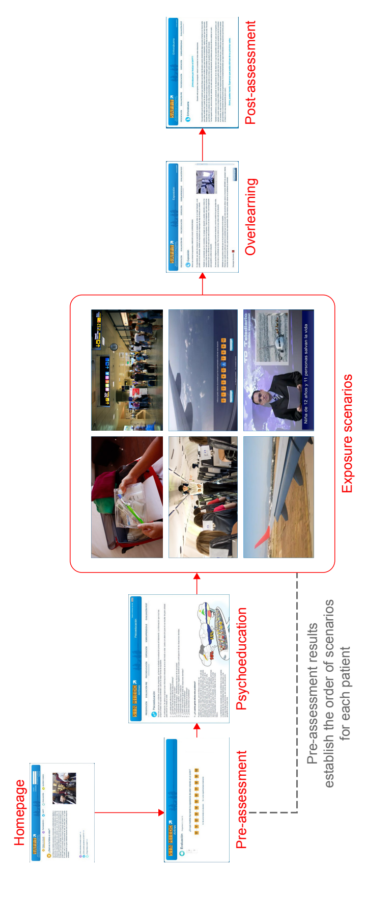
Figure 2 Navigation structure of the system.