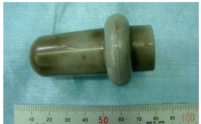
Fig. 3. Removed foreign body.