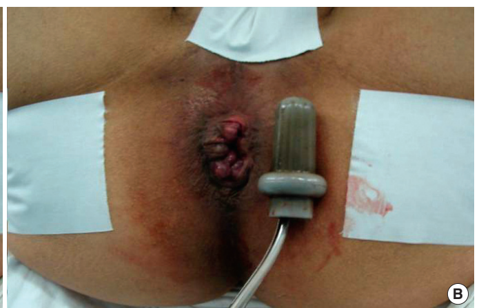
Fig. 2. (A) Removal of the foreign body. (B) Immediately after removal of the foreign body.